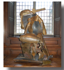
LIBRARY Table Piece Y -79(1986/1987) by Anthony Caro. This piece is made of waxed steel and is located in the passageway between the library and the Old Library, itself a home to frequent displays and exhibitions.

CHAPEL The Deposition (1999/2000) by Anthony Caro. This steel sculpture casts an imposing form as you walk through the doors from First Court leading to the Chapel. The College Chapel has also hosted occasional exhibitions in term tirm, including, in Spring 2009 a display of work by Levy Plumb studentship holder Tom de-Freston.