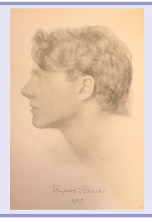
If you missed the exhibition, an online version is now available for viewing at: https://www.christs.cam.ac.uk/poetryand-place

Left: The opening of Chaucer's 'Reeve's Tale', in medieval Trumpington. Below: Rupert Brooke's 1914 and Other Poems (1915), including his most famous poem on Grantchester's Old Vicarage.