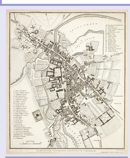
Nineteenth-century Cambridge. Magna Britannia (London, 1808)

Our Old Library exhibition explores the rich history of poetry about Cambridge by focusing on the poems and poets surrounded by the city. Here we introduce some highlights from the display.