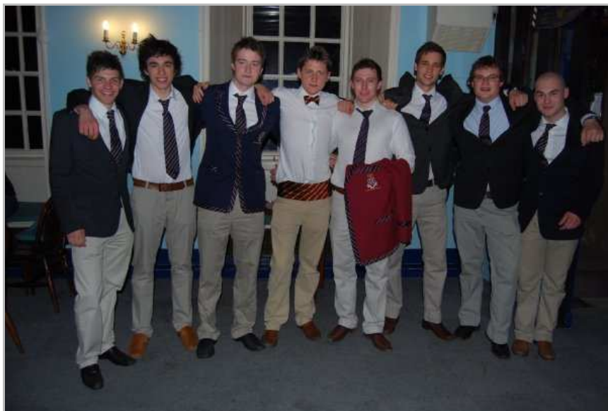
Committee 2009/10 along side 2008/09 after the Annual Dinner