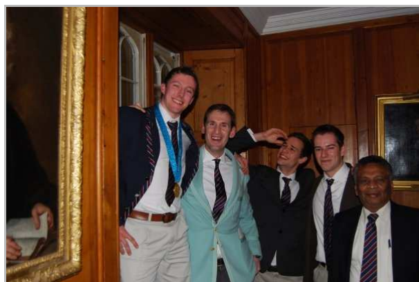
Annual Dinner 2009